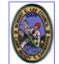
(CP-34s) 1998 Staff