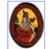
(CP-33s) 1997 Staff