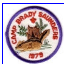
(CP-15s) 1979 Staff