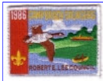
(CP-22s) 1986 Staff