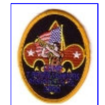
(CP-36s) 2000 Staff