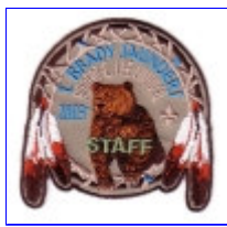
(CP-39s) 2003 Staff