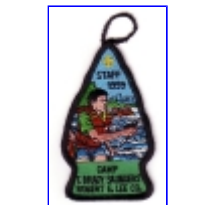
(CP-35s) 1999 Staff