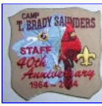
(CP-40s) 2004 Staff