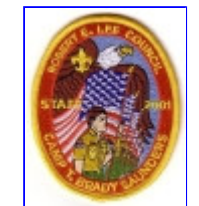
(CP-37s) 2001 Staff